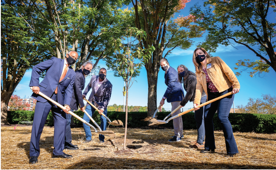
EcoWorks continued a partnership with Howard Hughes Corporation and Blossoms of Hope to plant 100 trees around the Merriweather District in Downtown Columbia.